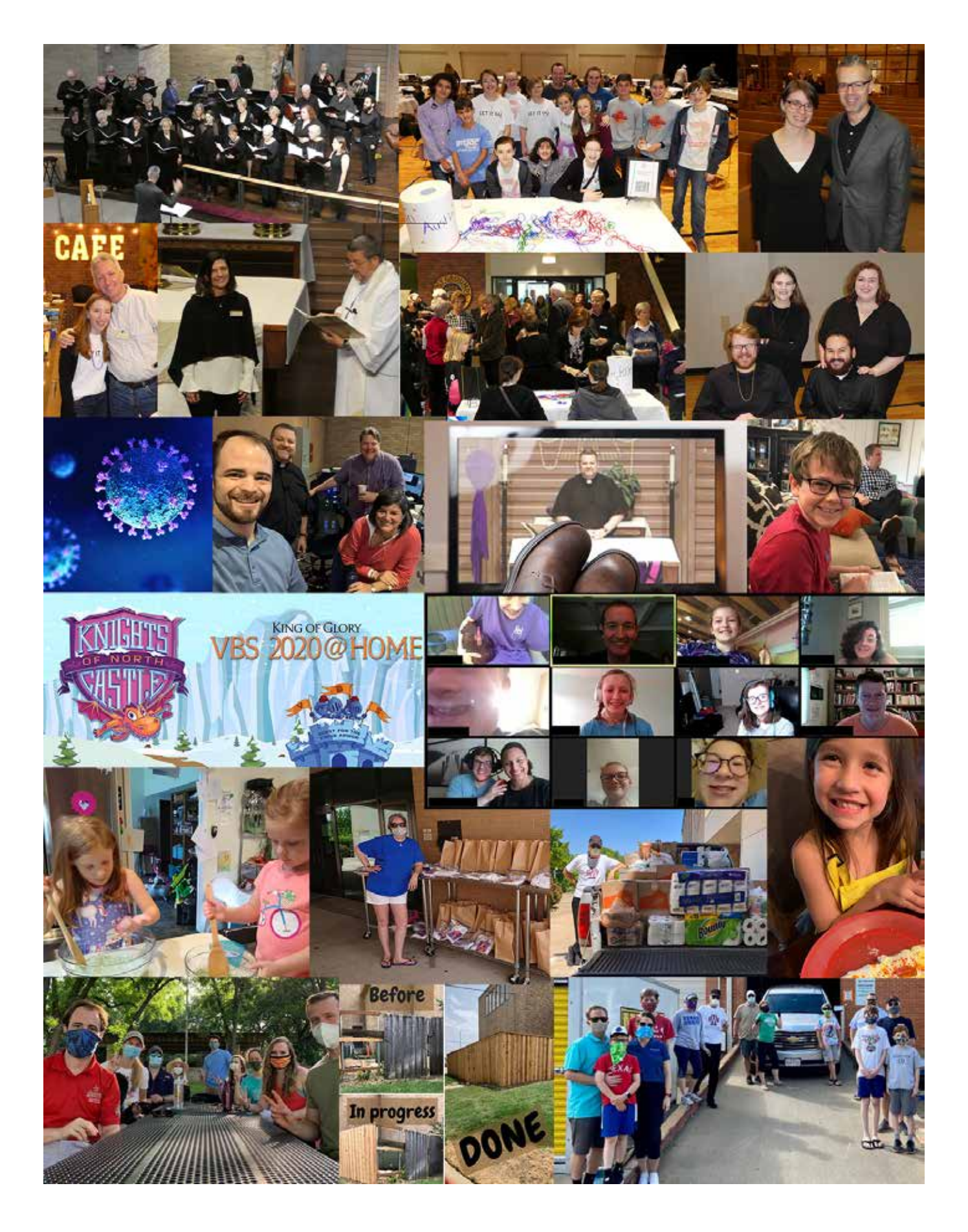
King of Glory Lutheran Church 2020 Annual Ministry Celebration